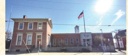
Bridgeton Public Library

Gary F. Simmerman Community Leadership Award