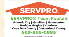
SERVPRO® Team Fabiani