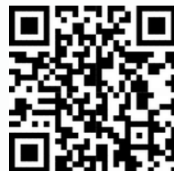
Chambers Legislative Breakfast 10-1-25

or contact the Bridgeton Area Chamber 856-455-1322 bacc@baccnj.com